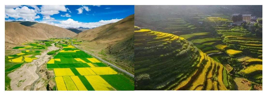
Valley Agriculture and Mountain Agriculture

On large farms with a wide range, the layout of Soil NPK Sensors is critical. In low-lying areas, soil conditions change rapidly. In different terrains such as hills, mountains, basins and river valleys, the Soil NPK Sensor can still play a good role and can be well-applied to different types of agricultural production.